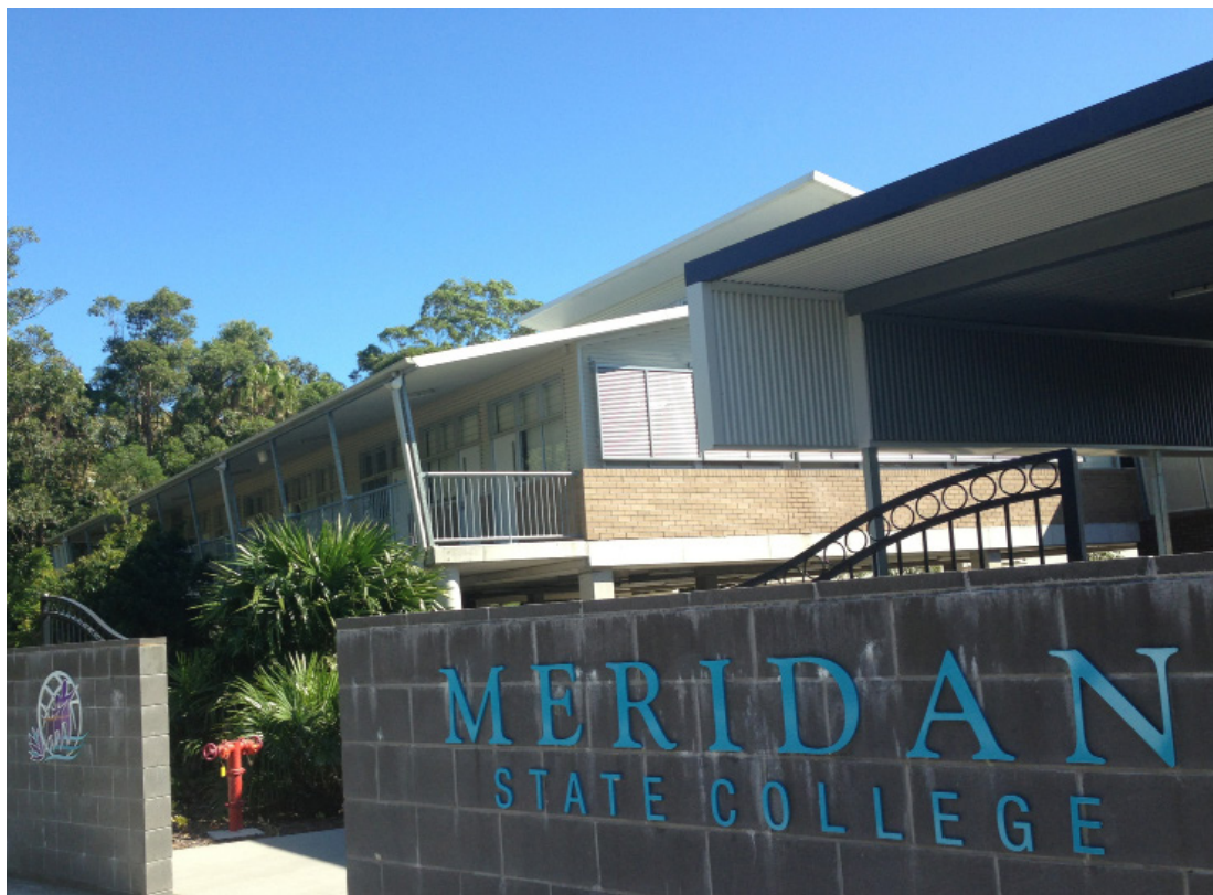
Secondary School Entrance