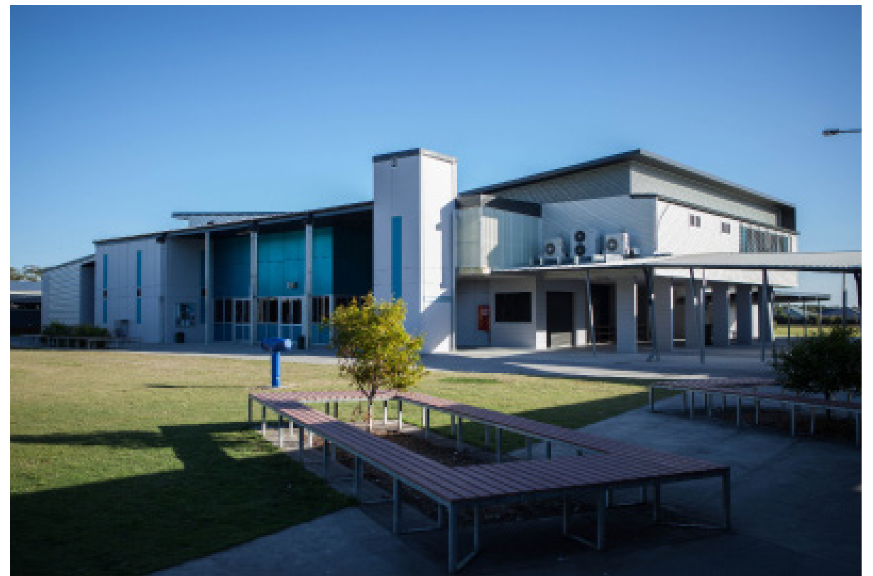
Performing Arts Building